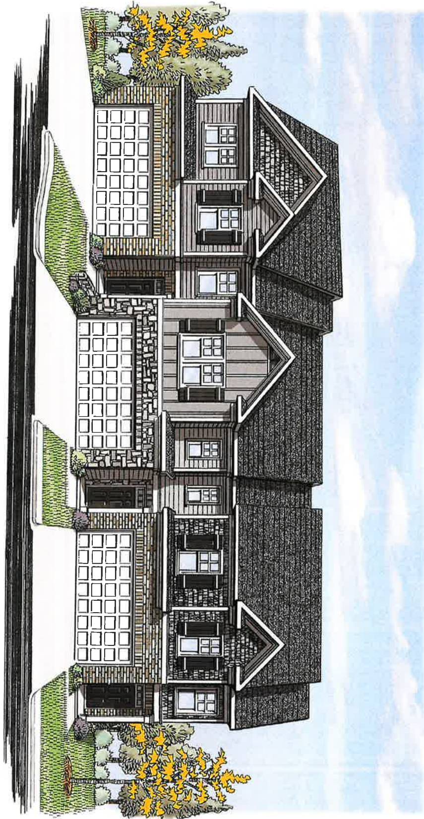
Exhibit "E" Elevations