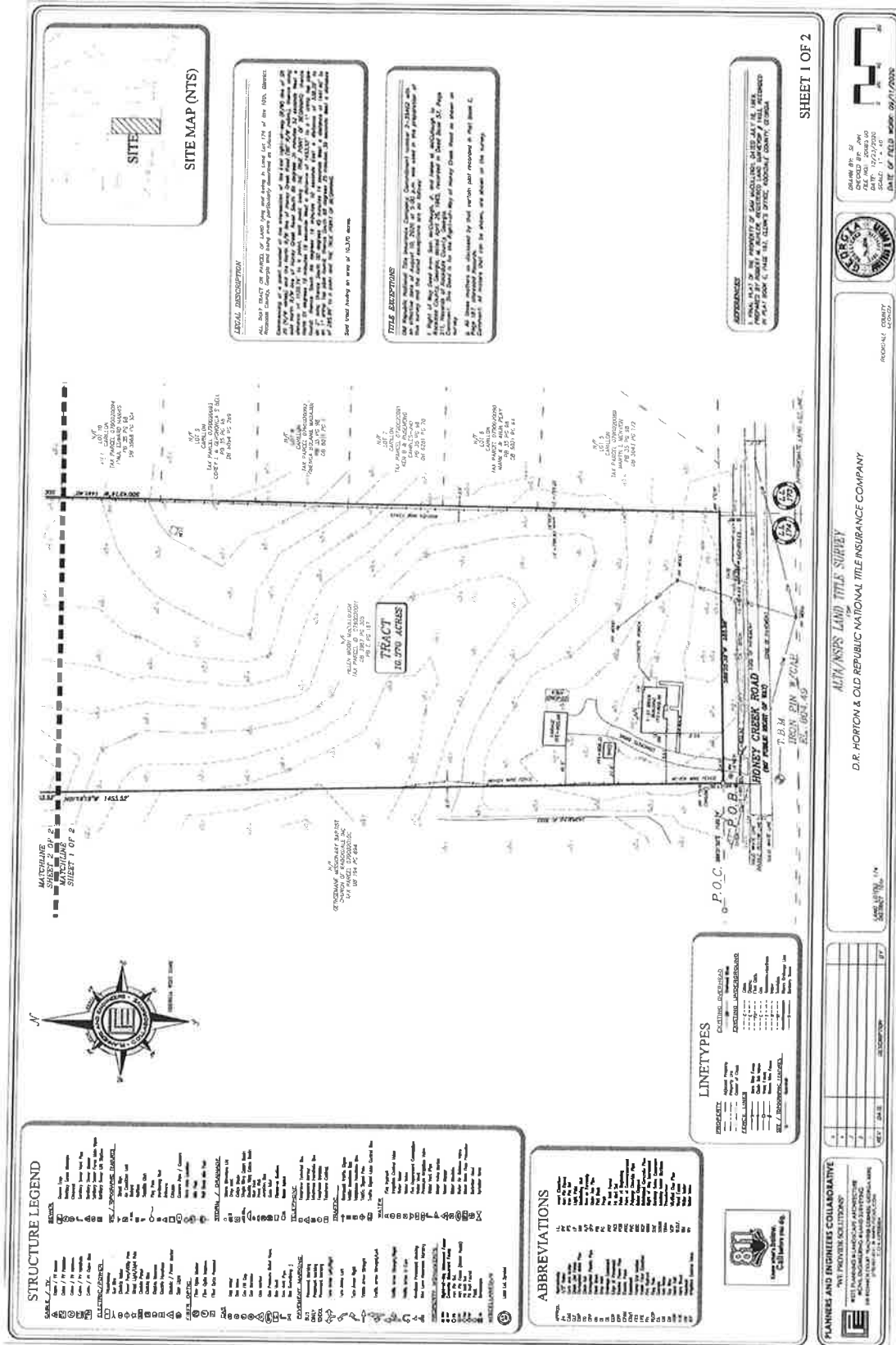
Exhibit "B" ALTA/NPSS Land Title Survey